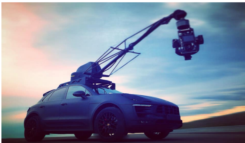
The Russian Arm Dynamic by Filmotechnic Remote Systems, The Netherlands