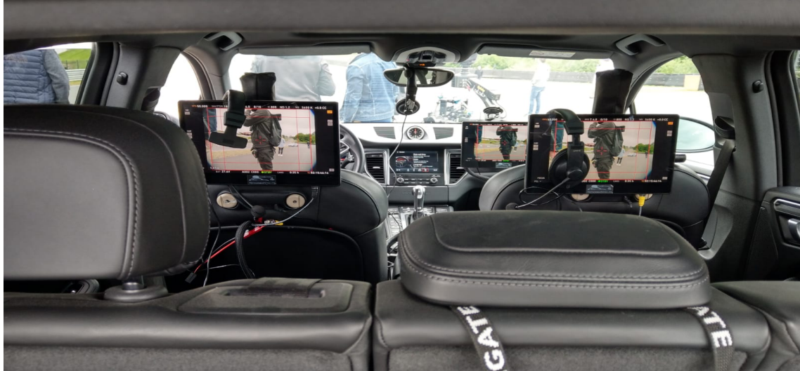
End of this document. By Filmotechnic Remote Systems, The Netherlands May 29 th . 2020